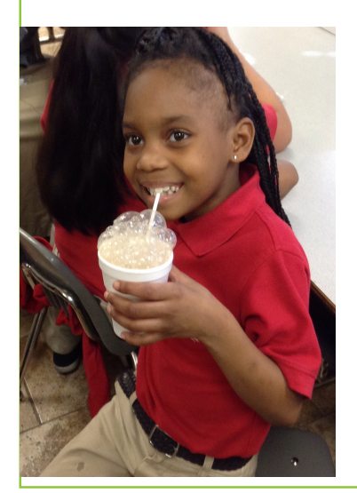
States of Matter Experiment

The students read different versions of the story, The Little Red Hen , completed a story map illustrating the characters, setting, problem, and solution in the story, illustrated the sequence of events in the story, and wrote their advice to the characters that did not want to help.